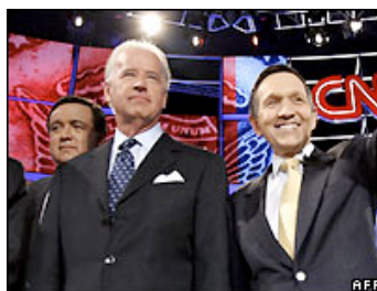
Candidates disagreed about marriage rights for gay couples

Mr Kucinich said he would. Senator Chris Dodd of Connecticut said he would not.