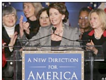
Nancy Pelosi will be second in line to the presidency

Democrats are taking control of the US Congress after 12 years as a minority, with a woman at the helm of the House of Representatives for the first time.