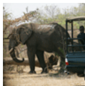
Brits Critical After Elephant Safari Fall