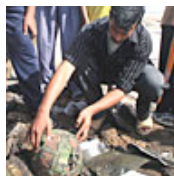
British Troops Killed In Blast To Be Named