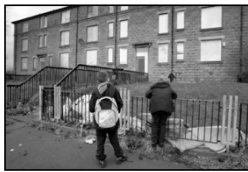
(2) Relative = possession of the basics but still unable to fully participate in society.