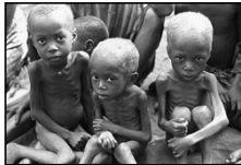
(1) Absolute = lack of basic human needs